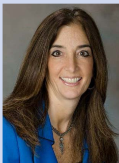
Hon. Eileen Filler-Corn (VA House Democratic Leader)